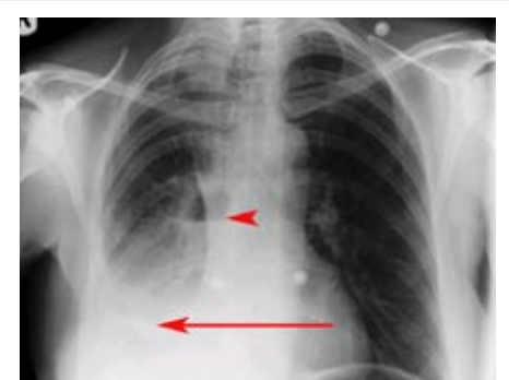
Chest radiograph showing an air fluid level close to the bronchial tree at the level of the bronchial stump (arrowhead) and opacification of the right hemithorax with loss of clarity of the right hemidiaphragm and right heart border (arrow)